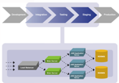
PerformaSure: Tuning during system testing

Services can be tailored to clients requirements and additional consulting days may be booked with any of the above offers. Please contact sales@decaresystems.ie for pricing and availability.